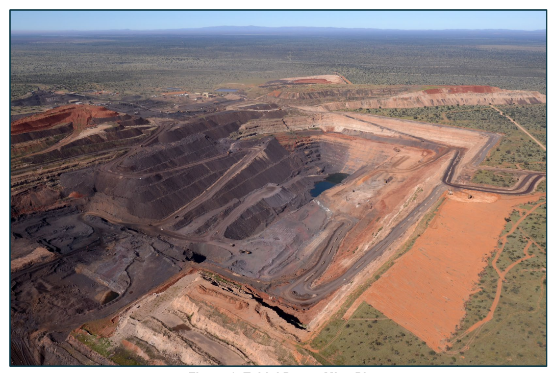
Figure 1: Tshipi Borwa Mine Pit

The Tshipi Borwa Manganese Mine is a long-life, open pit manganese mine with an integrated ore processing plant located in the Kalahari Manganese Fields in the Northern Cape Province of South Africa.